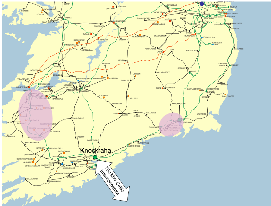
Figure 3 - Areas of the network with network violations for connection at Knockraha

With regard to the pink area in Figure 3 that is in the south west, a number of circuit overloads were identified as well as a low voltage / voltage collapse issue. These issues are all caused by large power flows from the Knockraha area towards Moneypoint along the 220 kV network in the south west region during high import scenarios on the Celtic Interconnector coincident with high wind generation levels on the system.