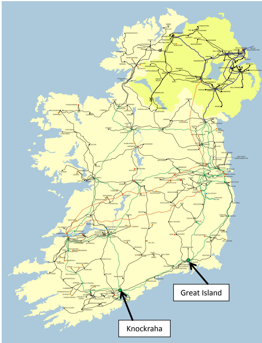
Figure 1 - Map of Irish transmission network showing potential connection points for Celtic Interconnector