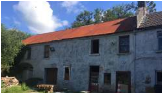
Greywood Arts Community Arts Centre LEADER grant: €167,614