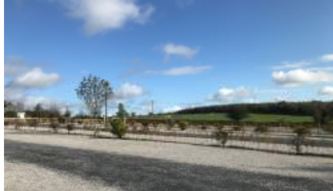
Leahy's Open Farm Overflow Carpark LEADER grant: €39,866