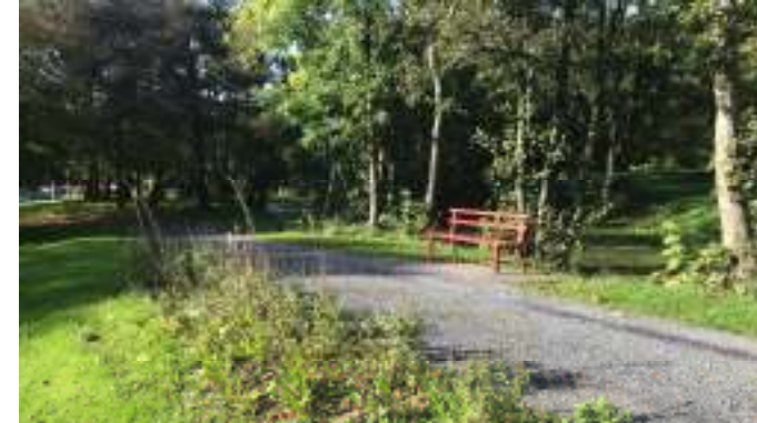
Carrigaline Pond Conservation LEADER grant: €28,630