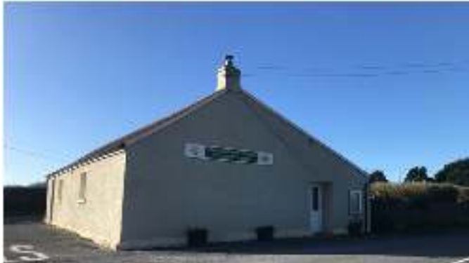
Churchtown South Community Hall LEADER grant: €149,791