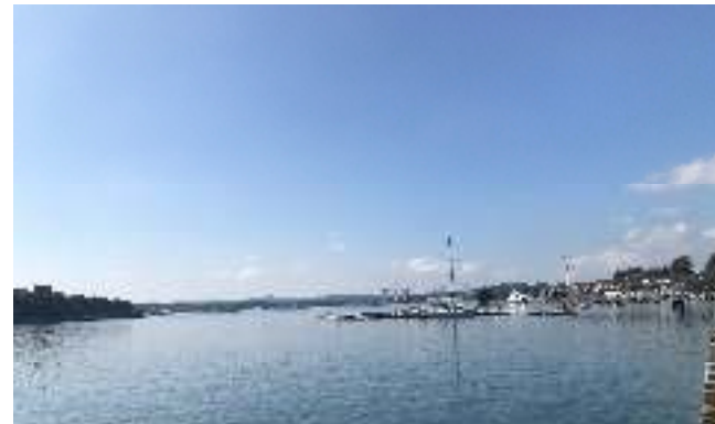
Whitepoint Marina, Cobh LEADER grant: €77,850